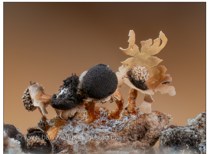
Above: two views of the miniscule Slime