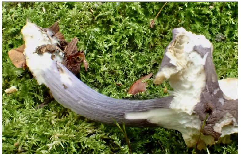
Right: the rare Calocybe ionides found today though not looking its best but still just recognisable. (LS)

Two more mushrooms to share with you: we came across a colony of Coprinellus disseminatus (Fairy Inkcap) growing on roots in the path with a further colony discovered in nearby vegetation but no doubt on more roots. A little further on a piece of rotting bare log was turned over to reveal some tiny white stemless caps, the largest seen here less than 1 cm across. I suspected from its pure white appearance that this was not a species of Crepidotus (Oysterling) – a genus having almost identical seashell-like stemless caps though with gills which soon turn beige when coloured by its brown spores – but was more likely to be Clitopilus hobsonii (Miller’s Oysterling). Though this species has spores which are not white but pinkish, the gills tend to remain white well into maturity, furthermore its spores are uniquely ridged, unlike any in Crepidotus , and I was able to confirm this feature at home later. It is not that often recorded but no doubt is regularly misidentified as a species of Crepidotus .