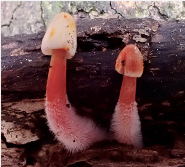
Left: The tiny immature Mycena crocata specimens uncovered by moving a fallen bare Beech branch today. Note the furry mycelial strands at its base attaching it to its substrate, this a common feature in many of the genus. (LS)

These were recognisable even at this immature stage as Mycena crocata (Saffrondrop Bonnet), one of our commonest and most distinctive species of Bonnet and found on fallen Beech - always in plentiful supply in the Chilterns. Mycena is a large genus with approaching 100 different species known in the UK, the vast majority needing a scope to identify. A few have unique characteristics visible in the field, this species being one of them: It contains bright orange latex (juice) in the stem which (when damaged) spreads also to the cap and gills. No doubt the damage occurred here when the log was disturbed thus turning one of the caps bright orange as well. Cap colour varies considerably from white to some shade of brown, but its latex is consistently saffron – hence its common name. By far its commonest tree host is Beech but it is becoming apparent that it does occur on other deciduous fallen woods on occasion: I have found it on both Birch and Lime in recent years where no Beech was present on site.