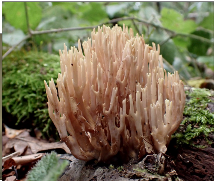
Right and above: Ramaria stricta both mature (right - LS) and immature (above BW).