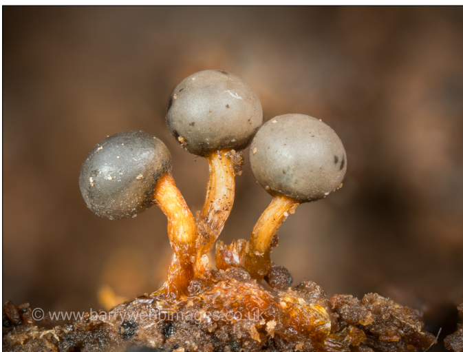
Mould Diderma floriforme (BW)