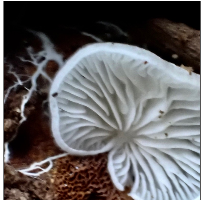
Above left: Coprinellus disseminatus . Above right: Clitopilus hobsonii . (LS)

On fallen Beech a small rather stunted coral-like fungus was found. Though I suspected it might be a species of Ramaria (Coral) I was not at all sure until nearby a larger more typical clump was spotted, confirming the ID. This was Ramaria stricta (Upright Coral), quite common and more often found in Beech litter than actually on wood as here. It was unusual and also useful to see it in both its mature and immature stage, however.